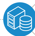
Asset Management Platform