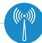
Wireless Service Provider